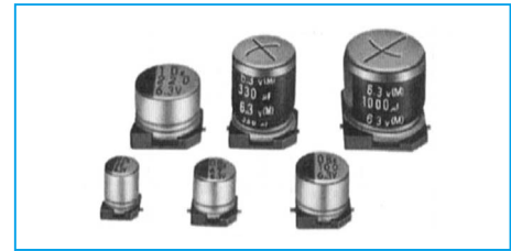
Marking color : Black print ( \phi 4 \times 5.3L - \phi 8 \times 6.5L, \phi 12.5 \times 13.5L ) White print on a brown sleeve ( \phi 8 \times 10L - \phi 10 \times 10.5L )