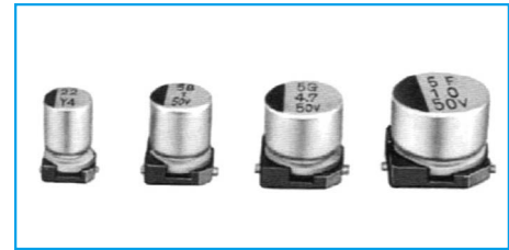
Marking color : Black print